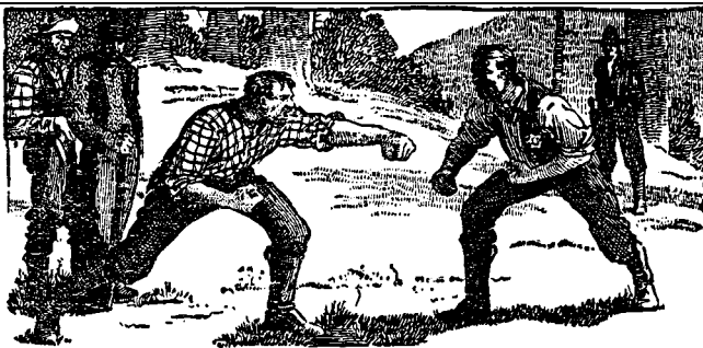
"Guns of the Mountain" Action Stories , May-June 1934