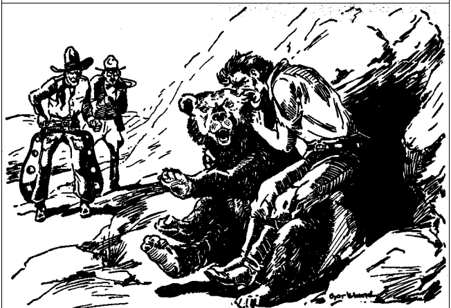
"The Haunted Mountain" Action Stories , February 1935