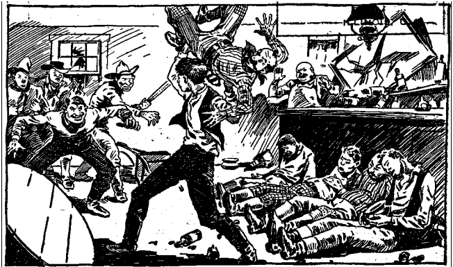
"A Gent From Bear Creek" Action Stories , October 1934