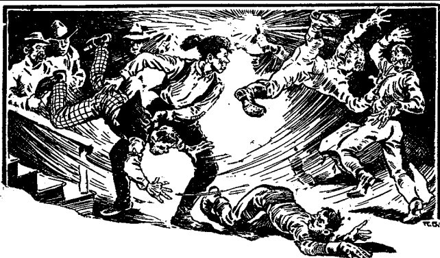
"The Scalp Hunter" Action Stories , August 1934