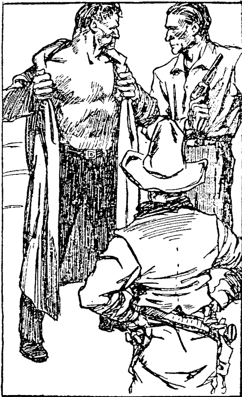
"Mountain Man" Action Stories , March-April 1934