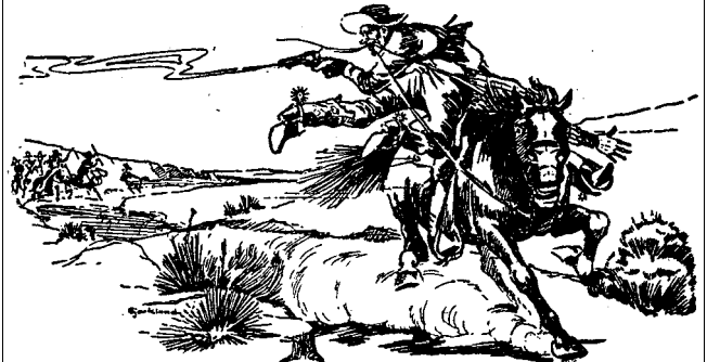
"The Road to Bear Creek" Action Stories , December 1934